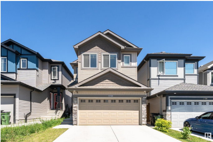
1730 Erker Way NW, Edmonton, AB

Main Floor Exterior Area 559.83 sq ft Interior Area 601.59 sq ft Excluded Area 393.83 sq ft