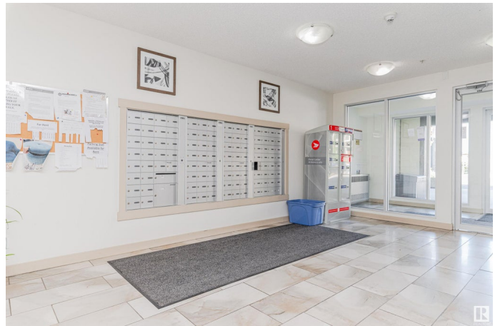
223-5816 Mullen Pl NW, Edmonton, AB