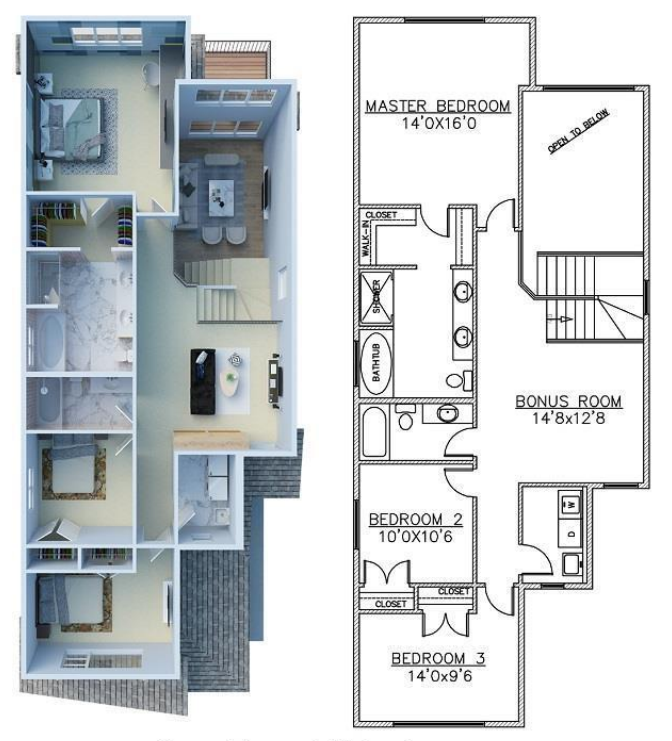
Upper Floor - 1147 sq.ft.

DATA IS DEEMED RELIABLE BUT IS NOT GUARANTEED ACCURATE BY THE REALTORS® ASSOCIATION OF EDMONTON. COPYRIGHT 2025 BY THE REALTORS® ASSOCIATION OF EDMONTON. ALL RIGHTS RESERVED. Trademarks are owned or controlled by the Canadian Real Estate Association (CREA) and identify real estate professionals who are members of CREA (REALTOR®, REALTORS®) and/or the quality of services they provide (MLS®, Multiple Listing Service®)